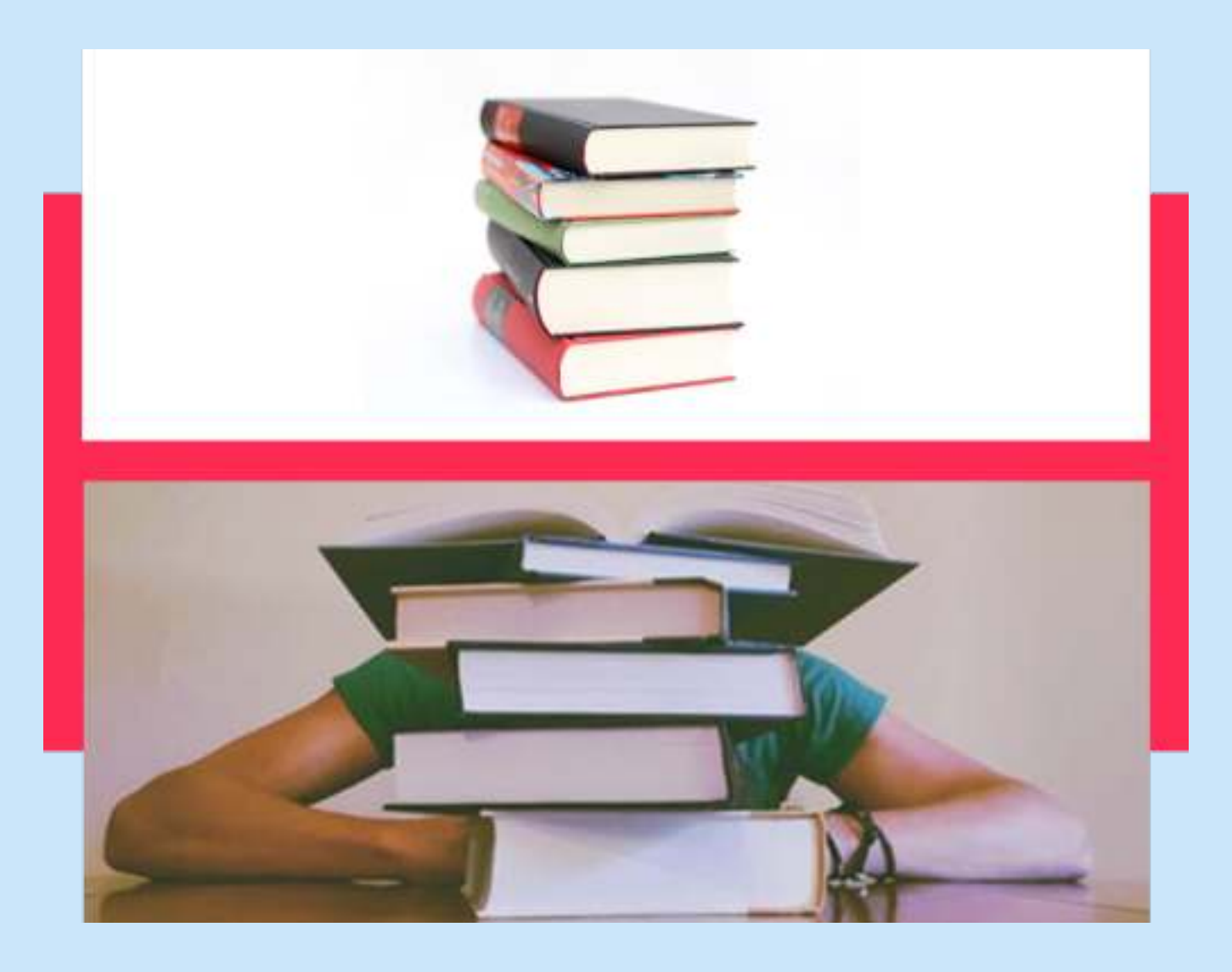
Chapter 1: The Habit Loop - How Habits Work

Habits emerge because the brain is constantly looking for ways to save effort. The habit loop: The process with our brain is a three-step loop. First, there is a cue, a trigger that tells your brain to go into automatic mode and which habit to use. Then there is the routine, which can be physical or mental or emotional. Finally, there is a reward, which helps your brain figure out if this particular loop is worth remembering for the future.